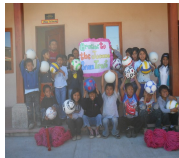
Children from the school with their new sports equipment

said, "We would like to say a huge thank you for the donations you have made to Education for the Children Foundation.